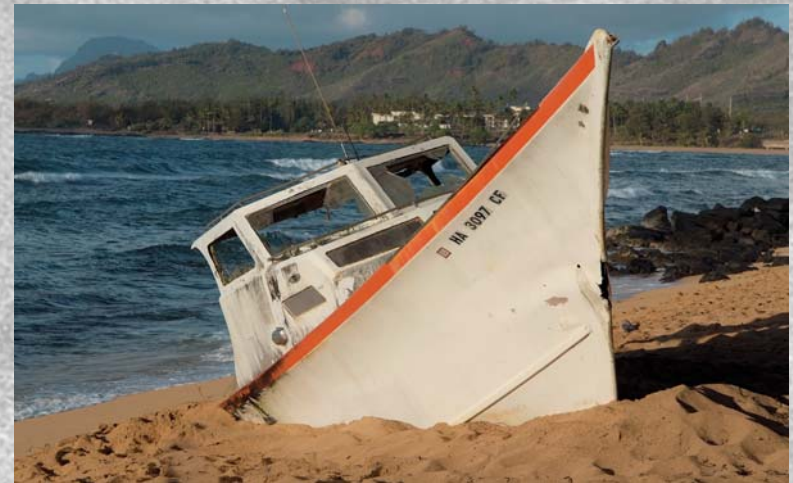
It's cool when you literally stumble across movie props, as we did with this shipwreck from local resident Ben Stiller's film Tropic Thunder.

Outbreak, North, Honeymoon in Vegas, Hook, Lord of the Flies, Flight of the Intruder, Throw Momma From the Train, The Thorn Birds, Uncommon Valor, Body Heat, Raiders of the Lost Ark, Fantasy Island, King Kong, Acapulco Gold, Islands in the Stream, The Hawaiians, Lost Flight, Hawai'i, Paradise Hawaiian Style, Girls! Girls! Girls!, Donovan's Reef, Blue Hawai'i, South Pacific, Miss Sadie Thompson and many more. Hollywood discovered Kaua'i years ago.