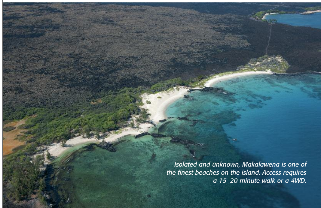
Isolated and unknown, Makalawena is one of the finest beaches on the island. Access requires a 15–20 minute walk or a 4WD.

nent part-Hawaiian family called the Magoons. They sold the land to a Japanese investor who had visions of a resort. When the state refused permission, the investor sold it to the state, which turned it into a park. The abandoned Magoon house is still located at the northern end of Mahai'ula Beach. This area abounds with freshwater springs that bubble to the surface, occasionally forming ponds. At the farthest northern part of the beach near some palm trees and a rock wall, you may see strange indentations in the sand at low tide. Here, freshwater gurgles right out of the sand and into the ocean. The snorkeling is only fair because the water can be a bit cloudy, especially during spring, and wild goats are common here. This is a good beach to get away from it all, yet still have fairly easy access. There's plenty of shade at the backshore. Access is via a bumpy, but usually driveable, semi-paved 1½-mile road halfway between the 90 and 91 mile markers on Queen Ka'ahumanu Highway north of