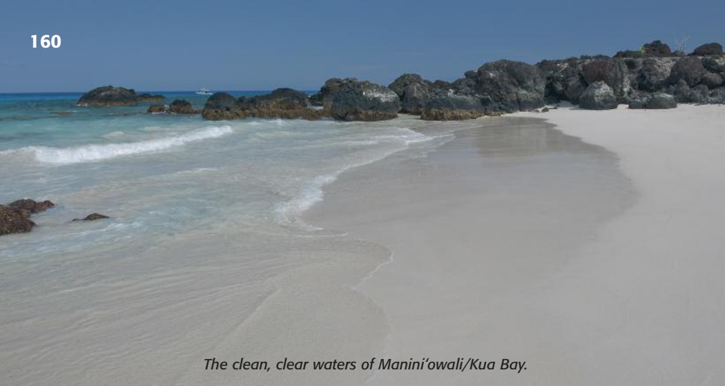
The clean, clear waters of Manini'owali/Kua Bay.

off to the right (north) is interesting not for its coral, but for the underwater relief. Boogie boarding is excellent during moderate surf, but the waves can be strong and deserve respect. There is sand here most of the time, but it is most abundant during the summer months. During the winter, high surf sometimes shifts the sand offshore for a time, leaving the area rocky and undesirable. Many residents consider this one of the best swimming beaches near Kona when calm, and on weekends they sometimes make their presence known. Crowds are less common during the week. From Hwy 19 take the paved access road between the 88 and 89 mile markers. Open 9 a.m. to 7 p.m., closed Wednesdays . Note that the waves here have a lot of power, so if the surf's up, don't go in. No shade at the beach , but restrooms and shaded picnic tables are available behind it.